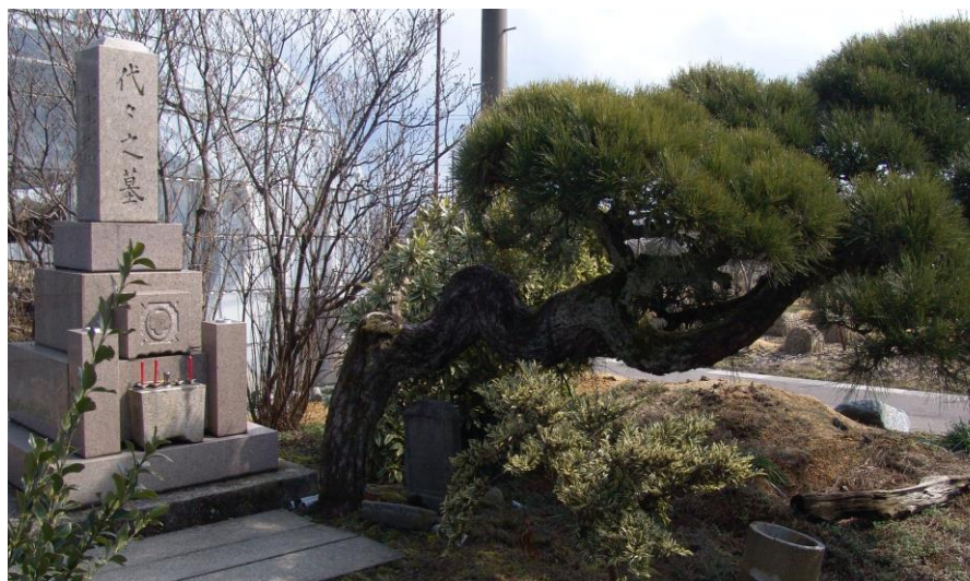
Haustempel in der Gärtnerei