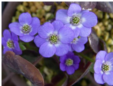
Die ideale Blütenform