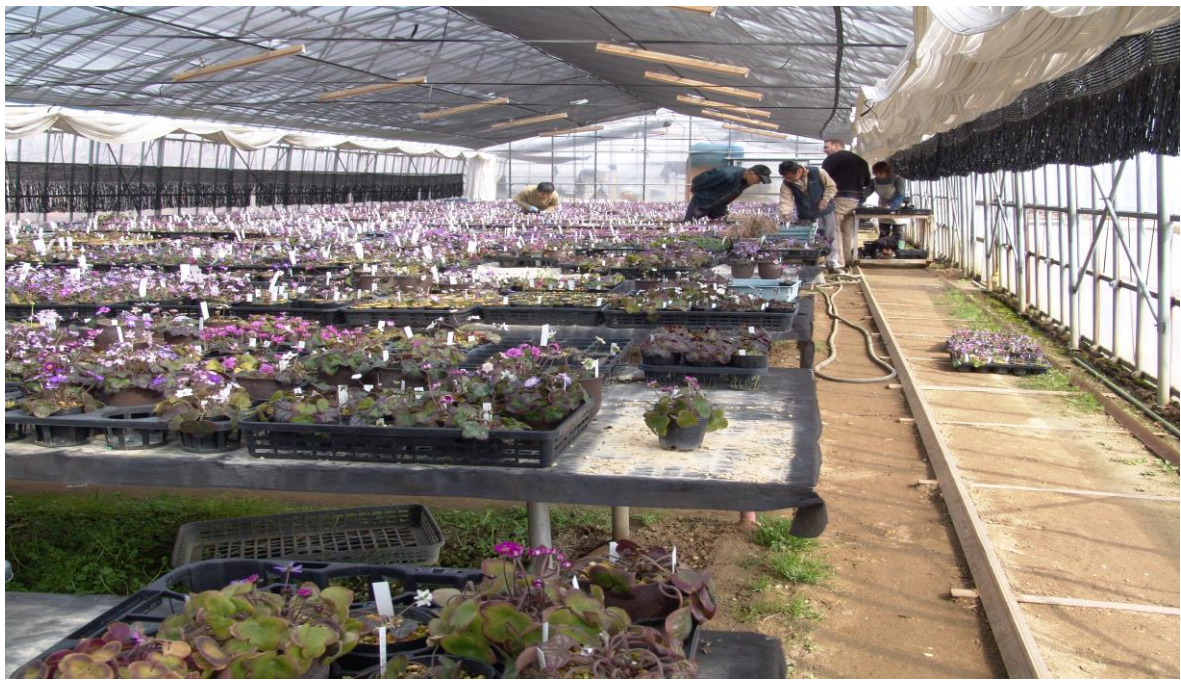
Alle sind am Begutachten im Folienhaus