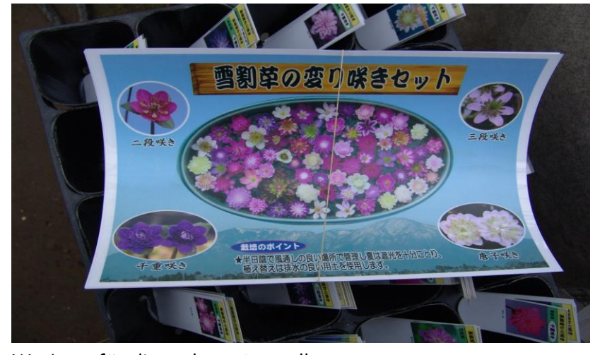
Werbung für die nächste Ausstellung