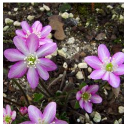
`Rot Weiß gestreift`