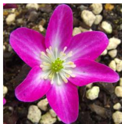
`Rot weißes Auge`