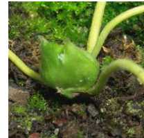
Vegetation bud of a 6 years old plant, diameter 0.8 cm

This hepatica, native only to central Sweden, is found there mostly in mixed forests, rarely in coniferous forests. Its buds, stems and leaves are almost hairless and light green. Thus, it has a unique position in the family of Hepatica. The flowers are always white, thus it gives the impression of an albino. The flower shape is uniformly round, rarely star-shaped, the flower diameter 1-2.5 cm. The stamens and anthers are also white, the ovary is light green. Its buds produce 5-8 flowers per basal bud, thus "glabrata" is a good bloomer.