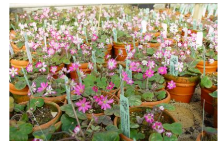
Growing in pots